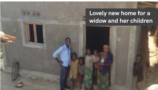
Lovely new home for a widow and her children