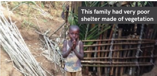
This family had very poor shelter made of vegetation

"Building houses together serves as an excellent platform for sharing the Gospel. As we work alongside others we are able to engage in conversation with the purpose of winning them over to Jesus."